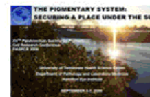
PASPCR 2009 Meeting