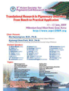
ASPCR 2009 Meeting

ASPCRIFPCSIFFPCSIFFPCS IFPCSESPCRIFPCSIFFPCS IFPCSIFFPCSIFFPCSIFFPCS IFPCSIFFPCSIFFPCSIFFPCS