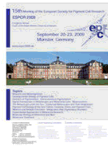
ESPCR 2009 Meeting