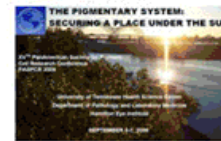
PASPCR 2009 Meeting